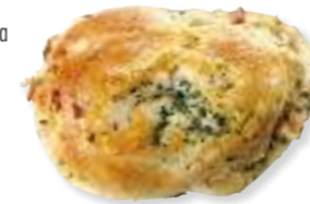
CHEESE & ONION BUN White Rock Baking Company (Kutchan) | ¥180

This delicious tomato and mozzarella filled puff pastry makes a perfect midday bite!