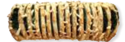
SPINACH & FETA PASTRY ROLL Koko at Odin Place | ¥350

Try this Japanese-style cheese and onion soft bun with savoury bacon chunks.