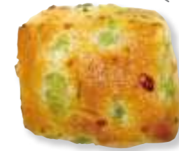
EDAMAME & CHEESE BUN Farine at Lucky (Kutchan) | ¥118 With a light crisp crust, this tasty edamame and cheese super soft roll is a perfect way to start the day.

On the run and having a cheese craving? These are some of our favourite cheesy morsels to a quick grab-and-go!