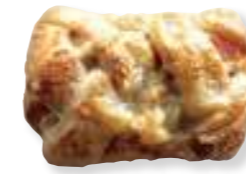
TOMATO & MOZZARELLA PASTRY An Deli | ¥380

This delicious tomato and mozzarella filled puff pastry makes a perfect midday bite!