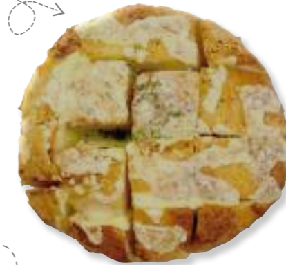
ANCHOVY & CHEESE BUN Guzu Guzu | ¥284

A spin on the classic garlic bread — pull apart and share at the table!